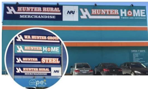
WB Hunter Rural- Shepparton